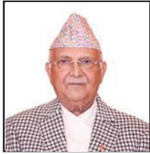
Prime Minister of Nepal