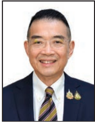
Minister of Foreign Affairs of the Kingdom of Thailand